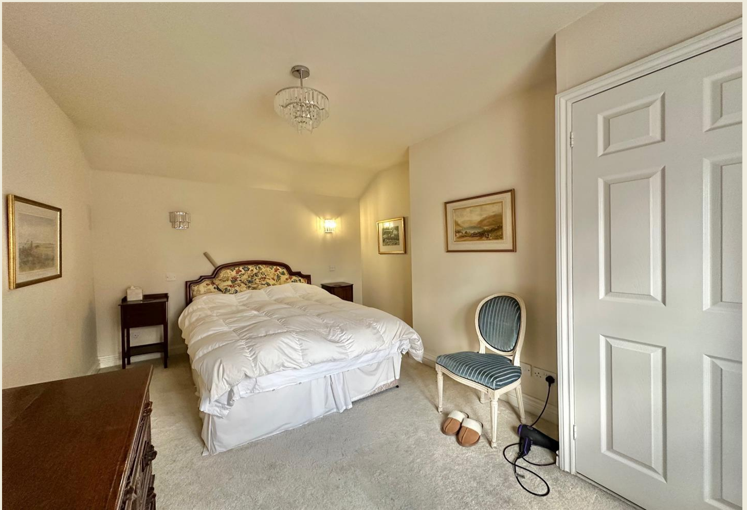
BEDROOM THREE 14'3 x 10'0