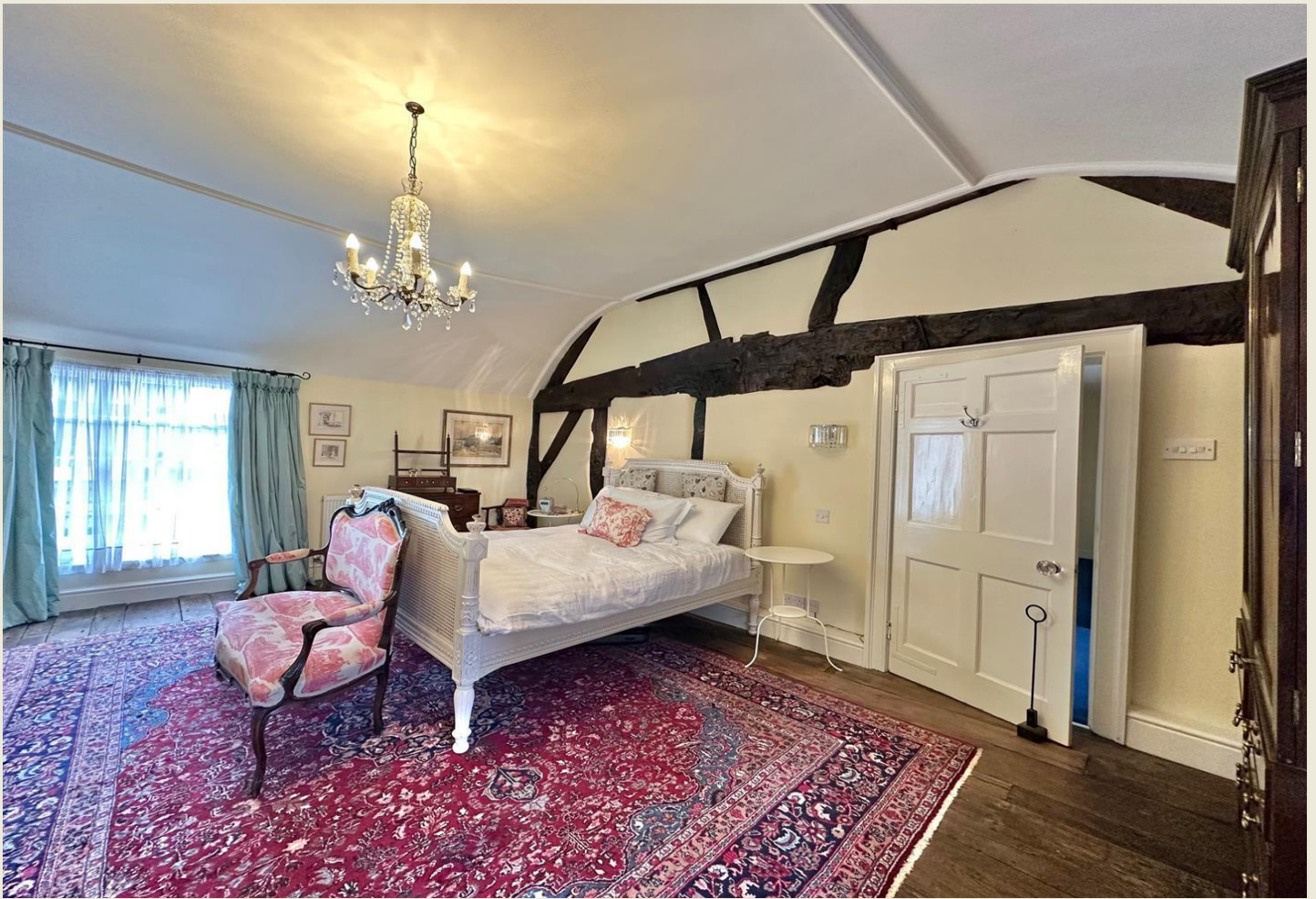
MASTER BEDROOM ONE 19'1 x 16'0