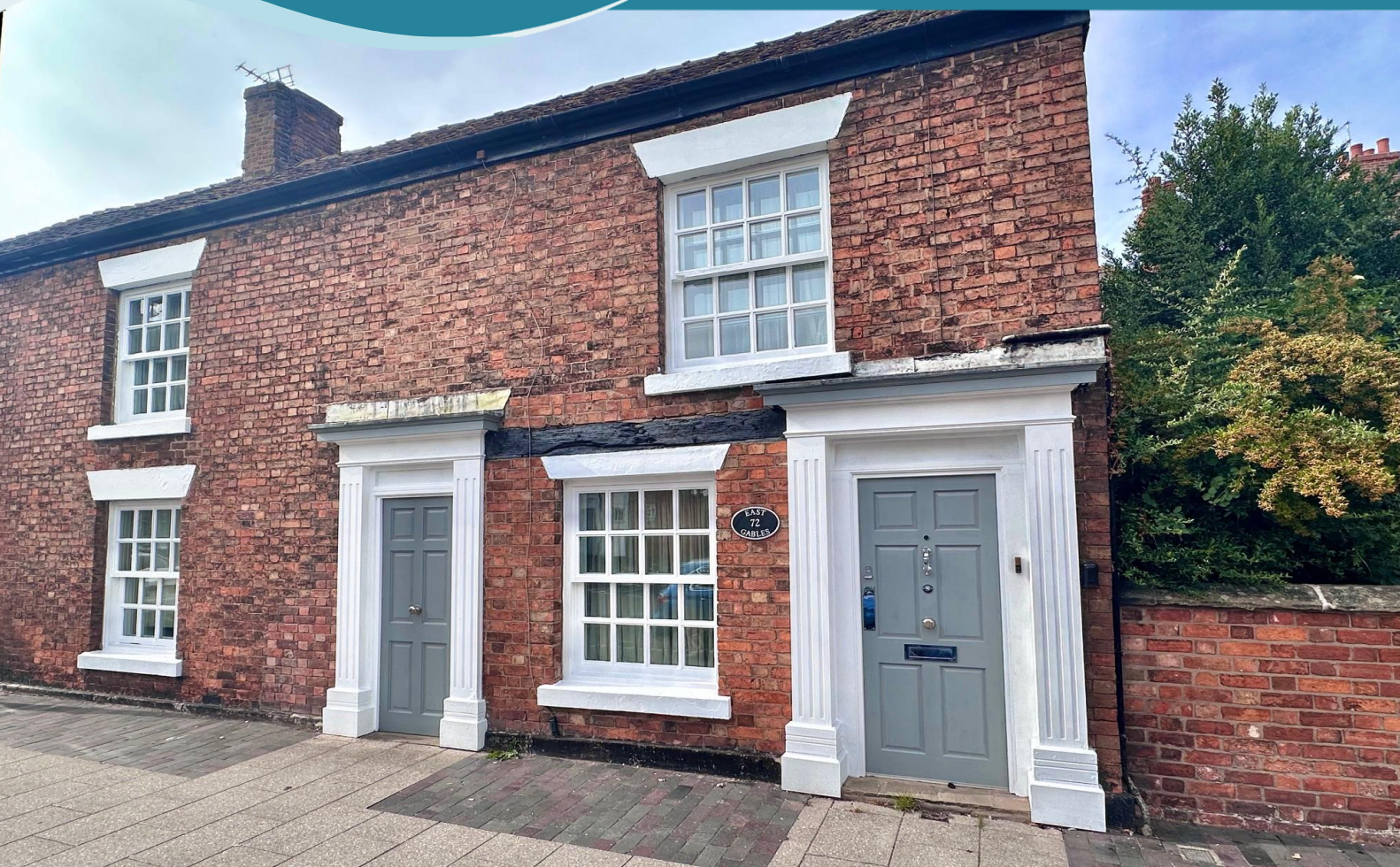
'EAST GABLES', 72 WELSH ROW | NANTWICH | CHESHIRE | CW5 5ET | OIRO £550,000