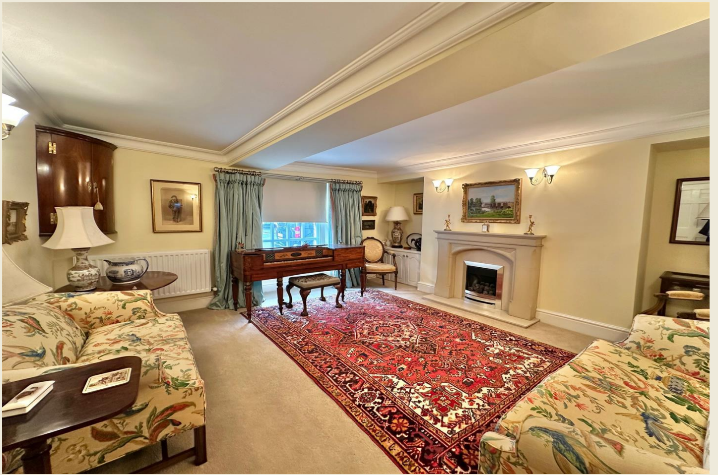
LIVING ROOM 15'8 x 14'2