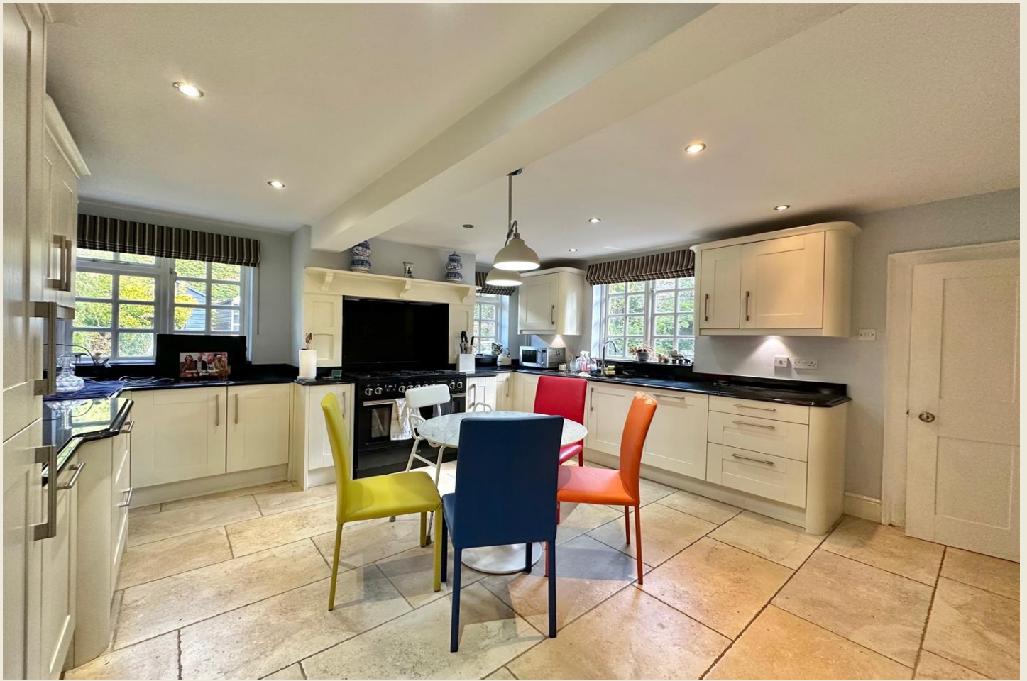
SPACIOUS KITCHEN BREAKFAST ROOM 17'1 x 14'5