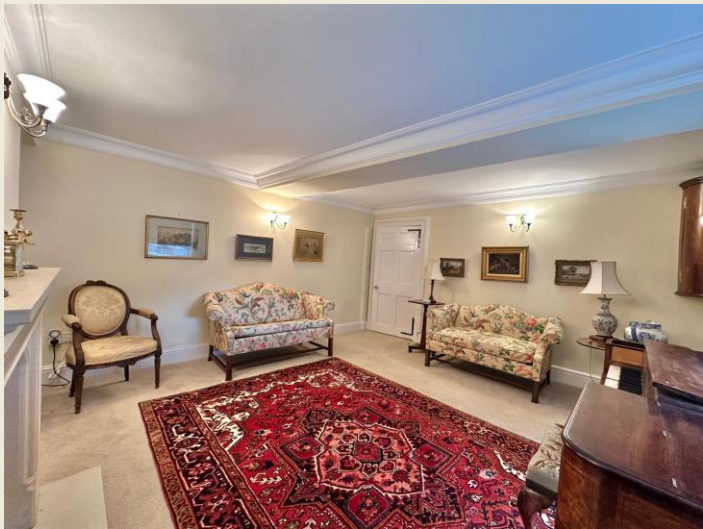
SITTIN ROOM (POTENTIAL HOME OFFICE / SNUG) 15'7 x 11'0